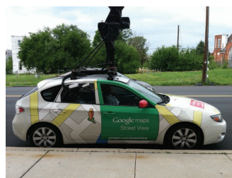
Google StreetView car spotted on N. 6th Street in Harrisburg

We also encourage guest columns and letters to the editor. If you would like to write or share an article with the GIS community, we will gladly include it. Email your article to nlernst@hacc.edu .